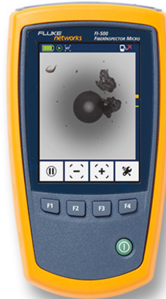
FI-500 displaying a dirty fiber endface